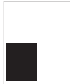
Quarter Page 2.875w x 3.625h